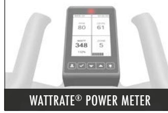
WATTRATE® POWER METER