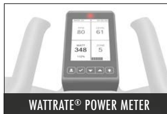
WATTRATE® POWER METER