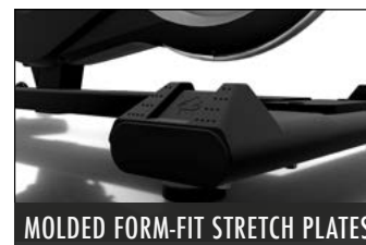
MOLDED FORM-FIT STRETCH PLATES