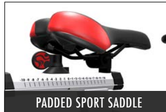
PADDED SPORT SADDLE