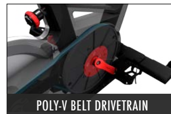
POLY-V BELT DRIVETRAIN