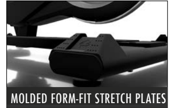
MOLDED FORM-FIT STRETCH PLATES