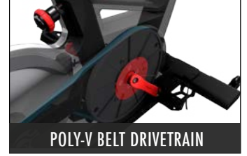
POLY-V BELT DRIVETRAIN