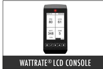
WATTRATE® LCD CONSOLE