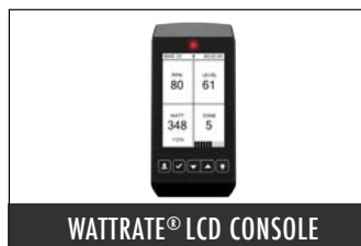
WATTRATE® LCD CONSOLE