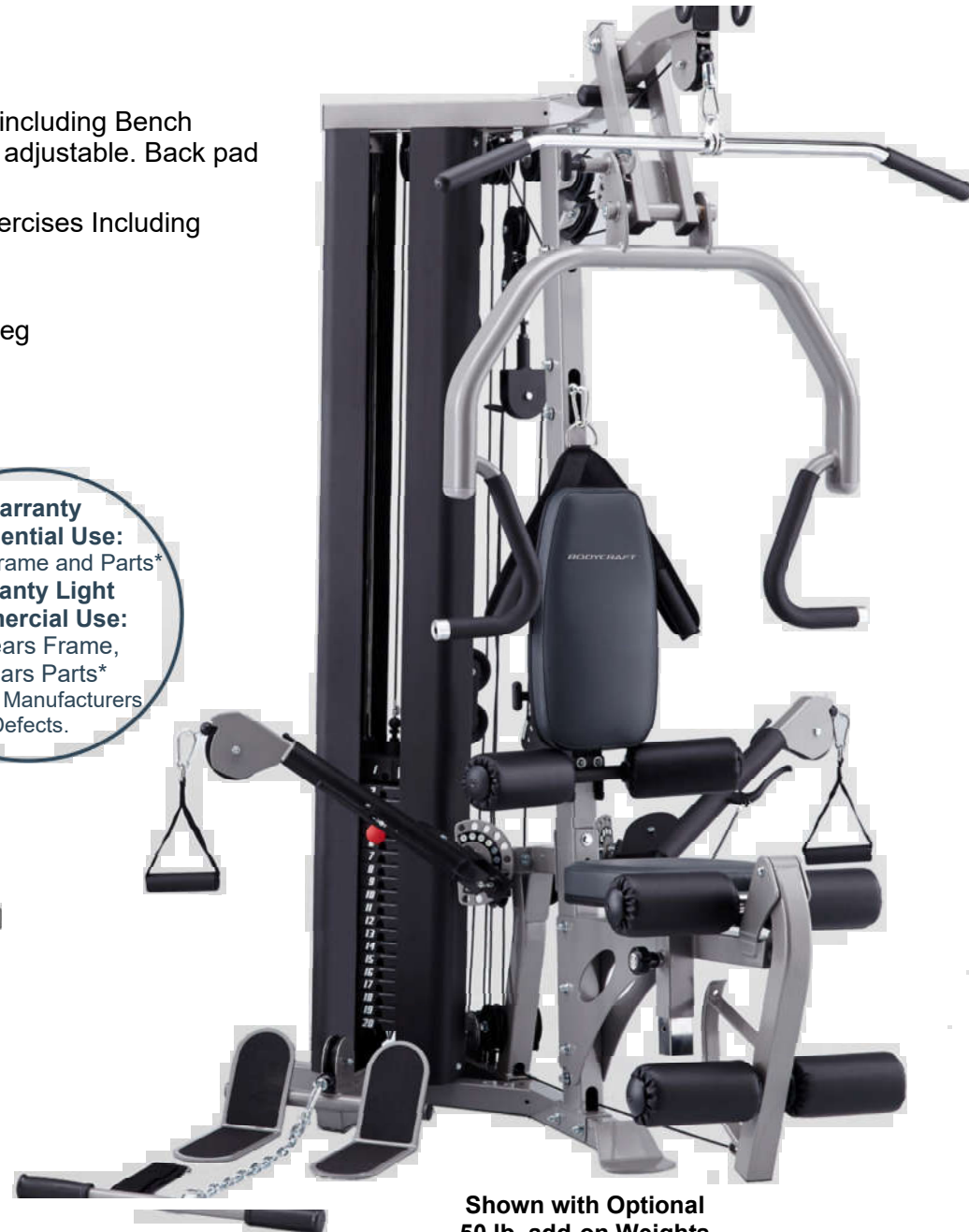
Shown with Optional 50 lb. add-on Weights

Warranty Residential Use: Lifetime Frame and Parts* Warranty Light Commercial Use: 10 Years Frame, 2 Years Parts* *Against Manufacturers Defects.