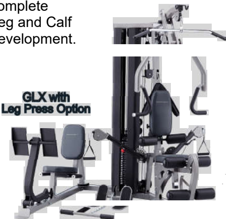
GLX with Leg Press Option

Available (2:1 Ratio) for complete Leg and Calf development.