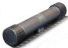
3" ROUND CALF BLOCK