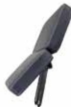
DONKEY SQUAT PAD