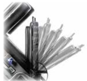
ADJUSTABLE UPPER FOOT PLATE