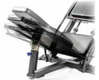
ADJUSTABLE LOWER FOOT PLATE