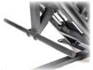
LONG WEIGHT PLATE HOLDERS (UP TO NINE 1.75" INCH PLATES ON EACH SIDE)

Our Lower Footplate is Gas Assisted & Features 5 Different Adjustment Angles and a Lumbar Support Pad Which Flips Up on a Hinge for Hack Squat. The Adjustments Allow the User to Correctly Position Themselves for Either Leg Press, Hack Squats, or Calf Raises.