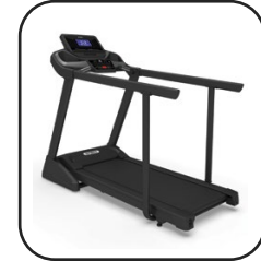
Optional Extended Handrails