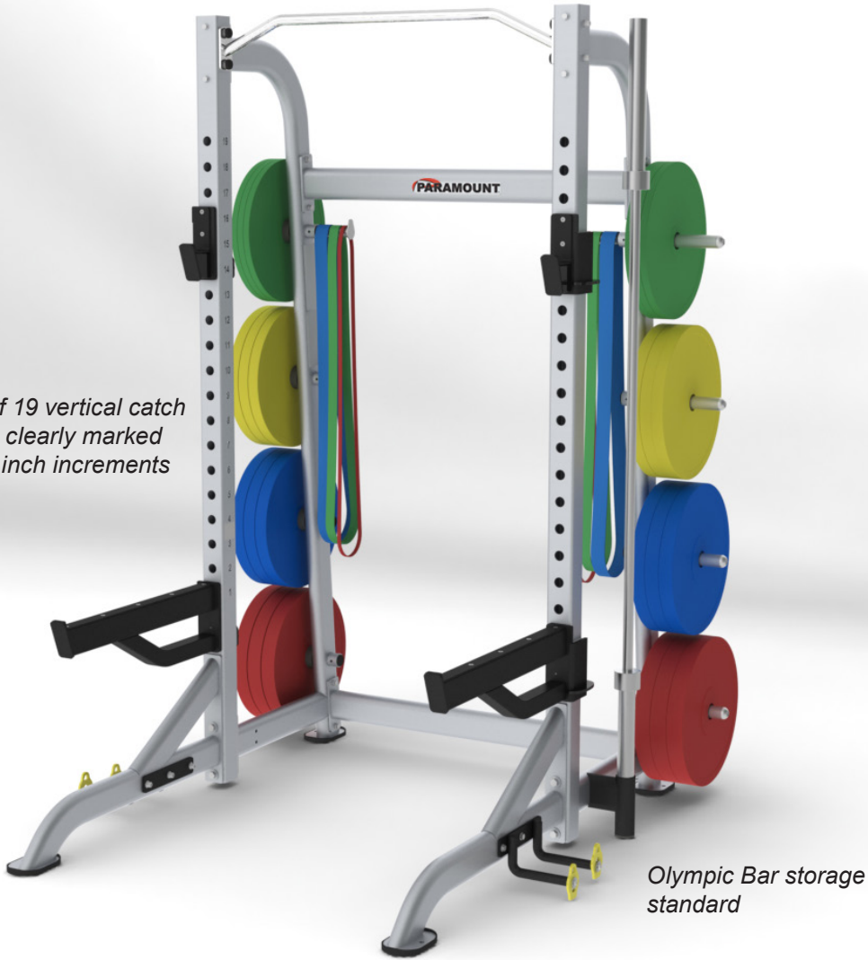
Olympic Bar storage standard

Choice of 19 vertical catch positions clearly marked 1-19 in 3 inch increments