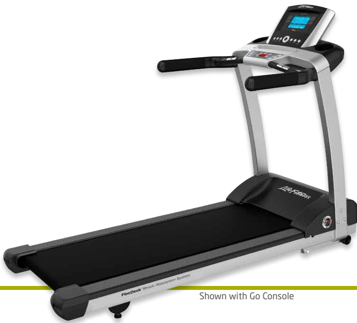
Shown with Go Console

The Life Fitness T3 Treadmill is designed with form and function in mind. From its sleek aesthetic curves that complement any home environment, to patented features that provide comfort and control, the T3 Treadmill is everything you expect from Life Fitness.