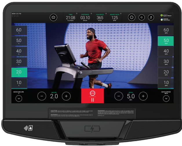
DISCOVER SE4 CONSOLE

CONSOLE OPTIONS Choose from the immersive experiences provided by the Discover SE4 Console (available in 24" and 16" sizes) or the get-on-and-go functionality of the SL Console.