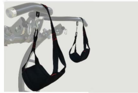
2x hanging straps