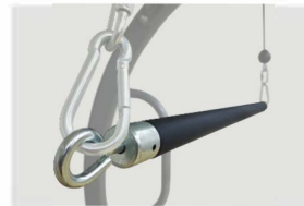
1x exercise bar