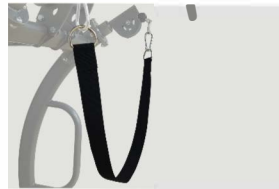
1x long strap