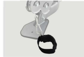
2x ankle straps