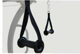
6x ergonomic handles