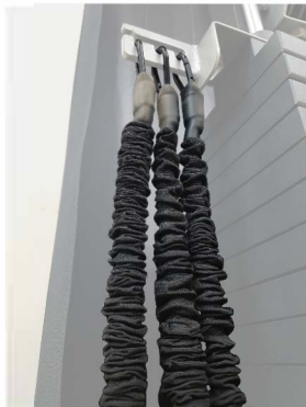
6x recoil resistance tubes