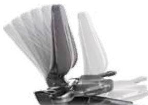
6 RECLINING & 16 FORE/AFT POSITIONS