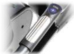
HR PULSE GRIPS W/ QUICK LEVEL KEYS