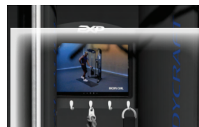
connect 22 touchscreen tablet