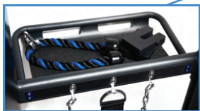
Built-in accessory tray.