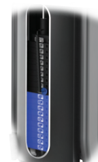
250# upgradeable wt stacks